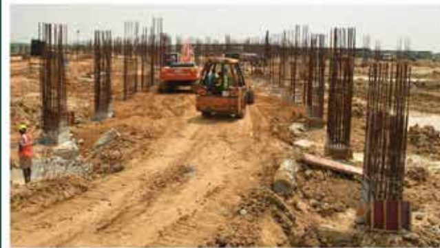
Project Corporation has expedited the construction work of the integrated bus terminus (IBT) and the truck terminal at Panjappur in Tiruchy.

20 km from the city at a strategic location on the Panjappur Bypass, the IBT is a major project for the city. The project is being implemented by the Corporation. The IBT is a major project for the city. The project is being implemented by the Corporation. The IBT is a major project for the city. The project is being implemented by the Corporation.