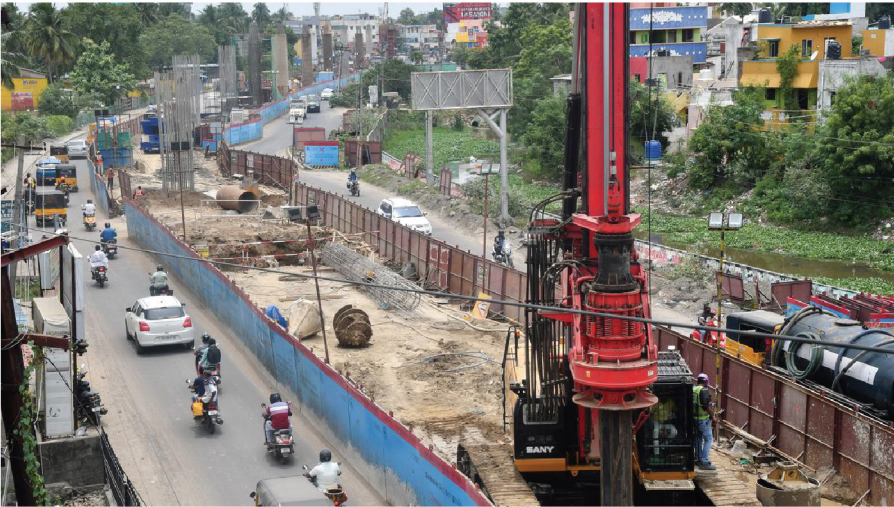
Chennai Metro rail work in full swing at Kovilambakkam on the Madhavaram-Siruseri line, which is proposed to be extended till Kelambakkam.

Corridors 3, 4 and 5 to be extended till Kelambakkam , Parandur and Avadi respectively.